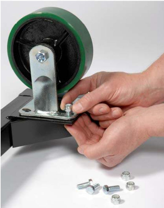
Wheel Assembly with Included Hardware. Assembly