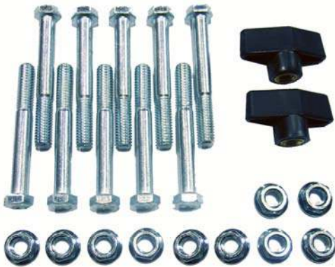
Exploded View of Stage Storage Cart Assembly Hardware