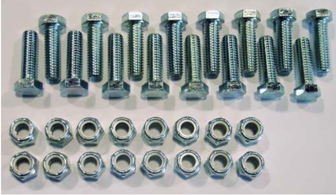
Included Caster Hardware if Applicable

It will be a lot easier if you have two people to assemble carts. As we mentioned above, your cart may or may not have been shipped with the 4 casters attached. If they are attached, proceed to step 2. If not, you need to attach each of the 4 casters. Your cart comes standard with 2 each rigid and 2 each swivel casters.