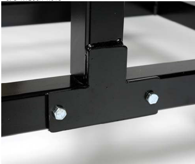
Exploded View of Upright assembly Upright In Place