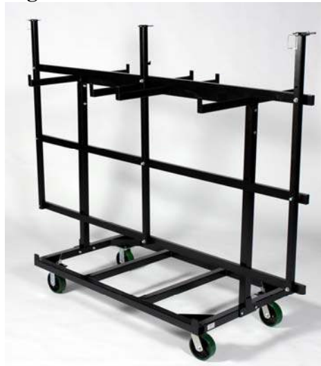
Guardrail Storage Cart

Below you will find an exploded view of cart as well as included hardware for assembling cart. (Fig. 3 and 4)