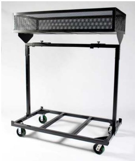
Exploded View of Basket Assembly Cart With Basket