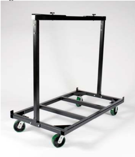
Vertical Stage Deck Storage Cart