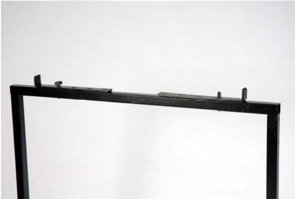
Close Up View Of Locking L-Bracket Rotated For Storage