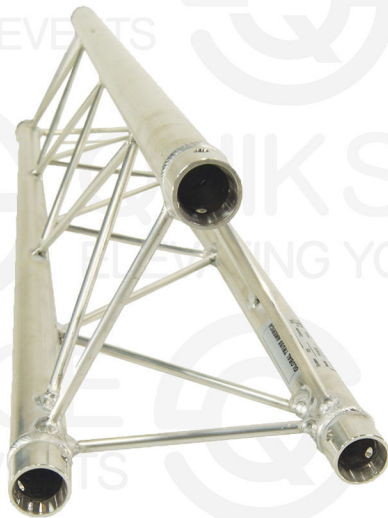
8 5/8" or 220 mm Triangle Aluminum Truss with Quick Connecting Ends