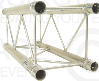
8 5/8" or 220 mm Box Aluminum Truss with Quick Connecting Ends