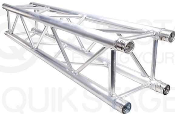
11 7/16" or 290 mm Box Aluminum Truss with Quick Connecting Ends